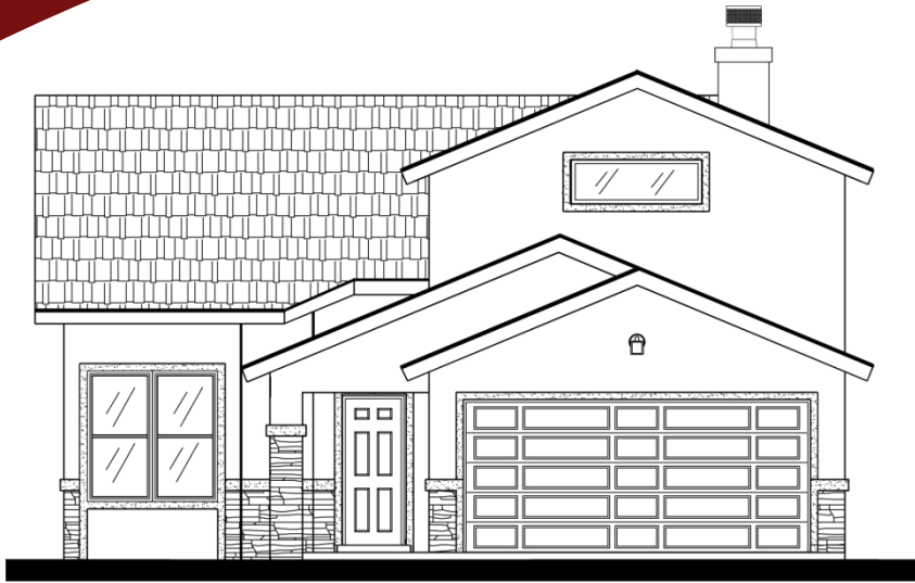
R1619A - ROCK